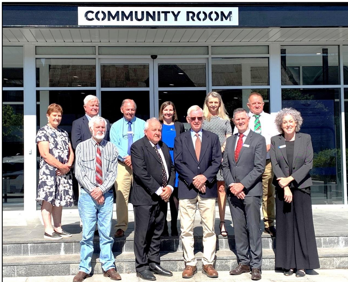
Councillor Brewer absent from photo.